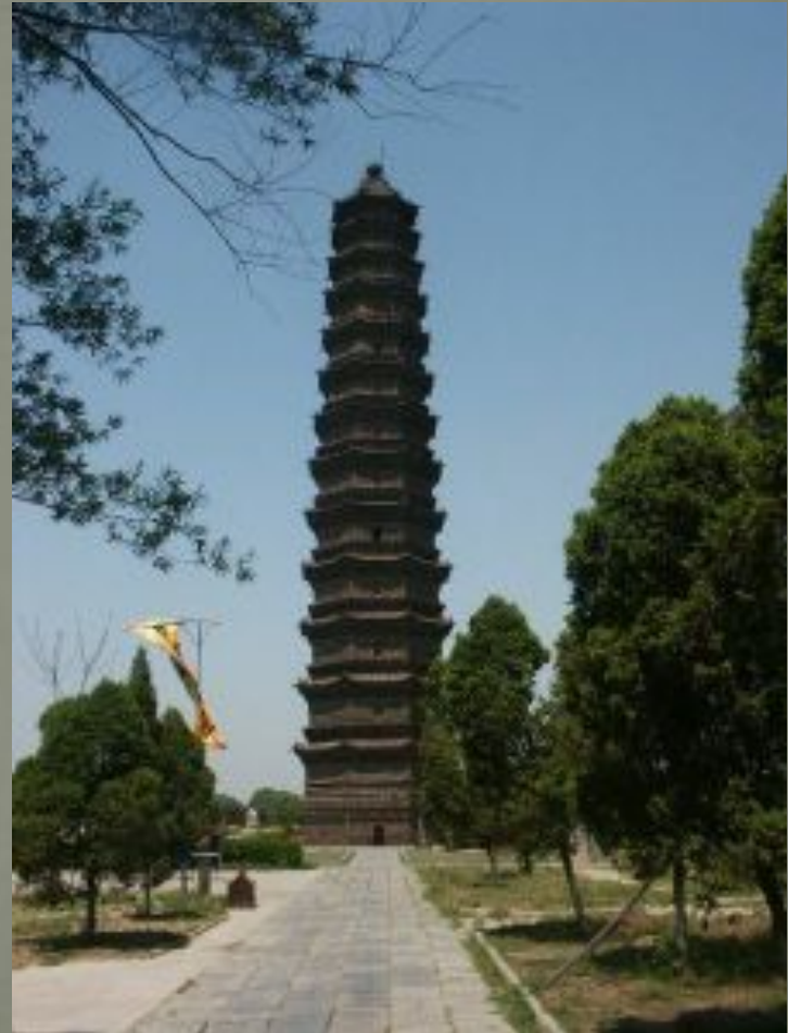
Iron Pagoda, Kaifeng, China