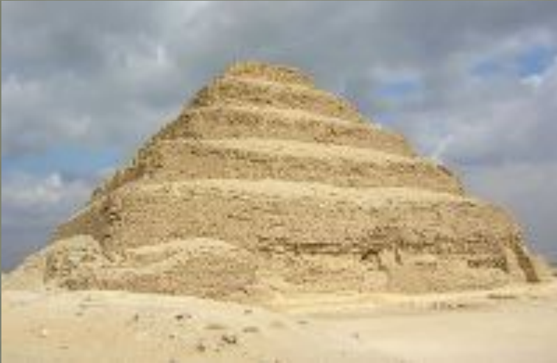
Step Pyramid of Zoser, Egypt