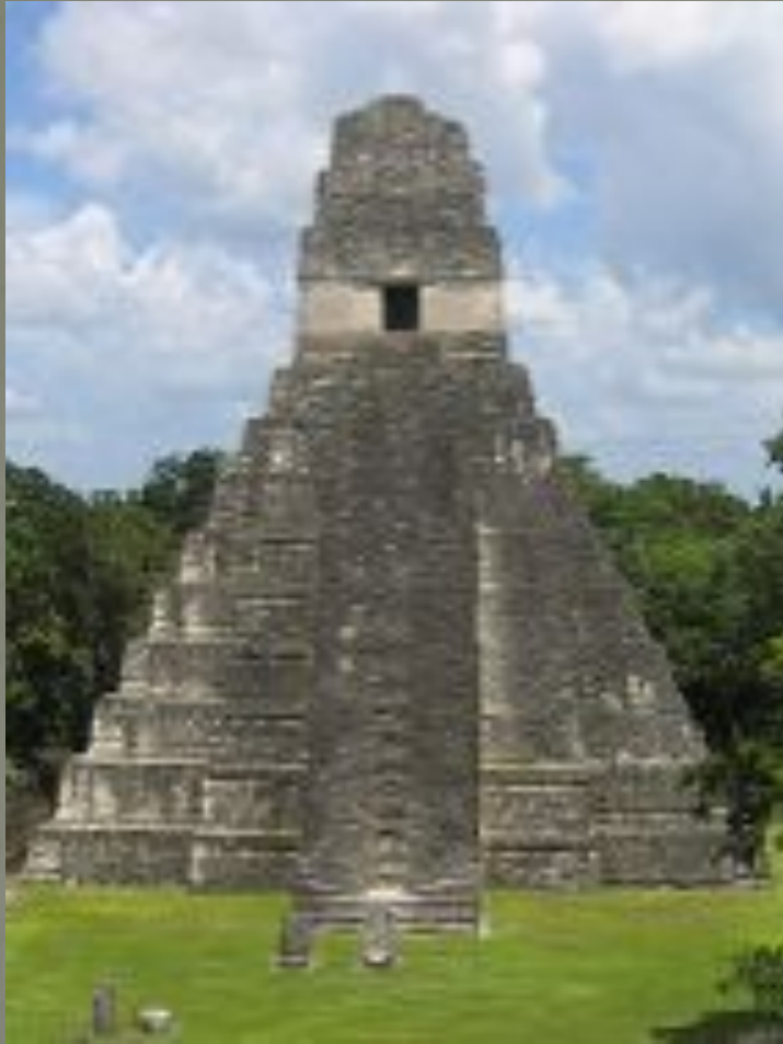
Tikal Temple, Guatemala