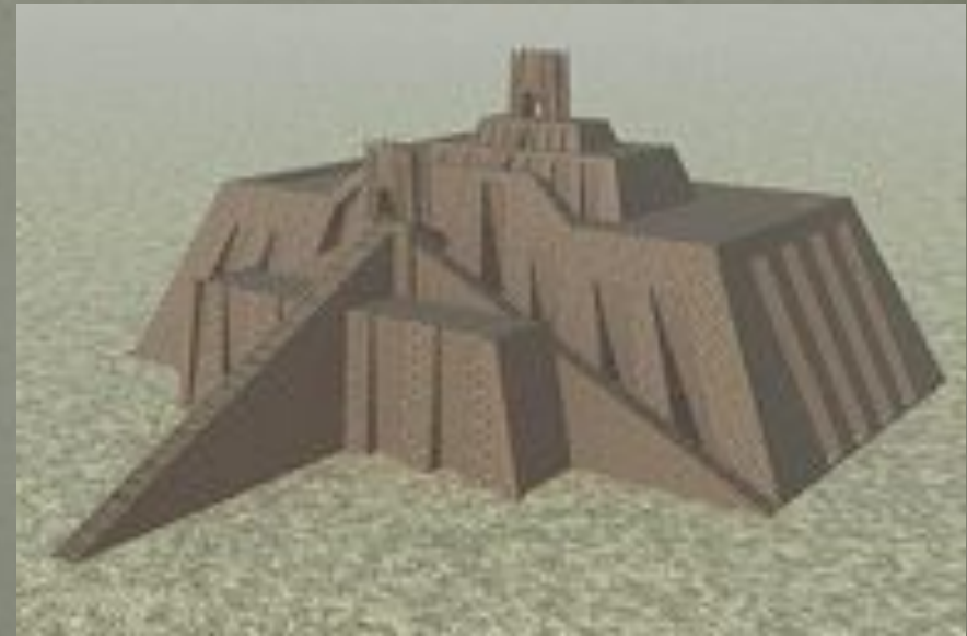
Ziggurat at Ur