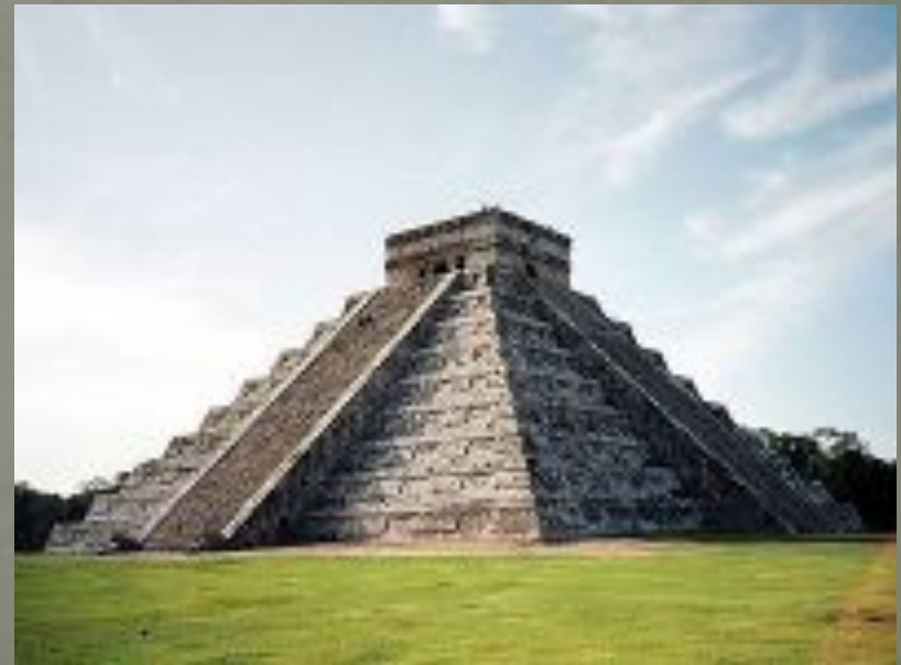
Chichen-Itza Ziggurat, Mexico