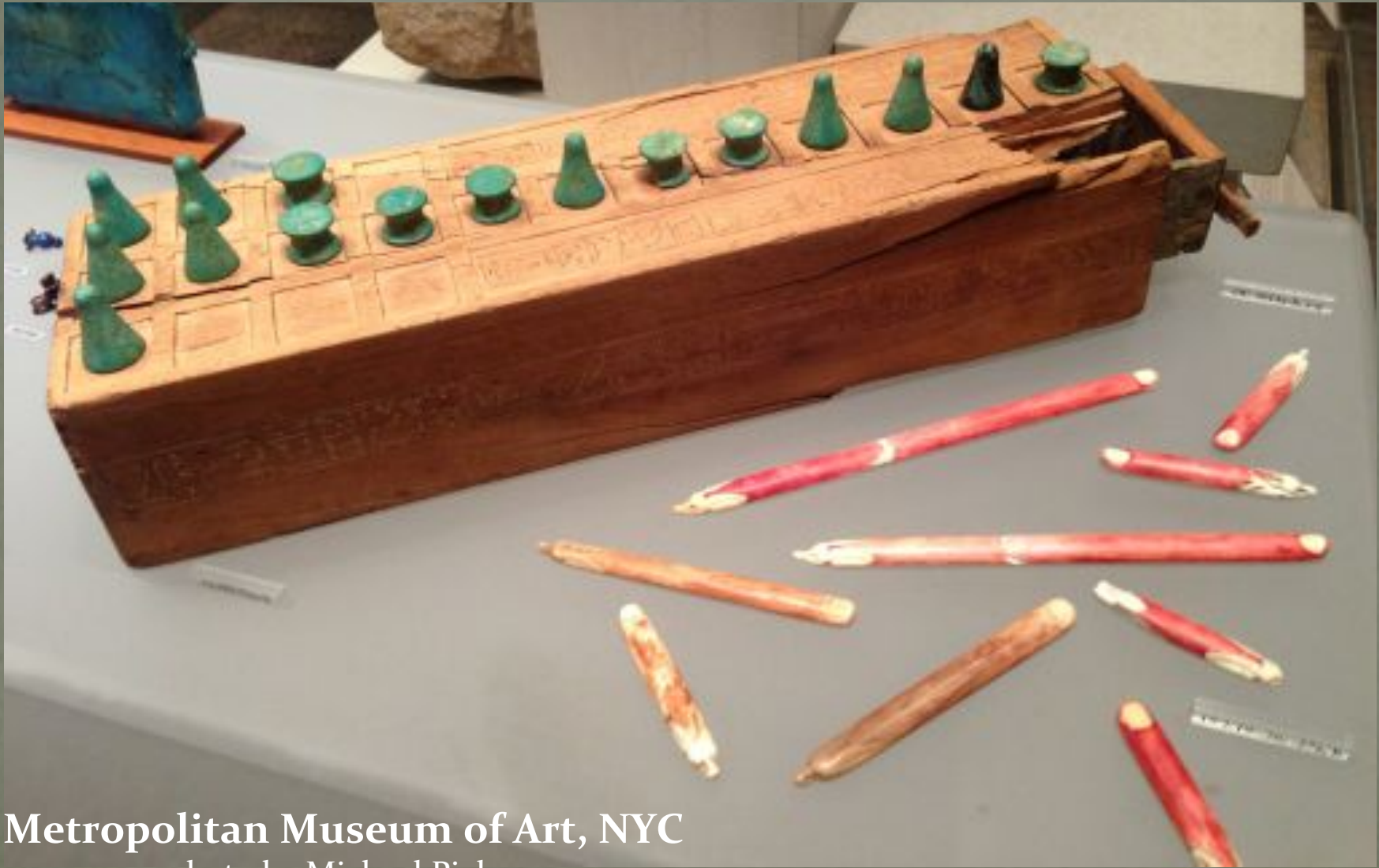
Metropolitan Museum of Art, NYC